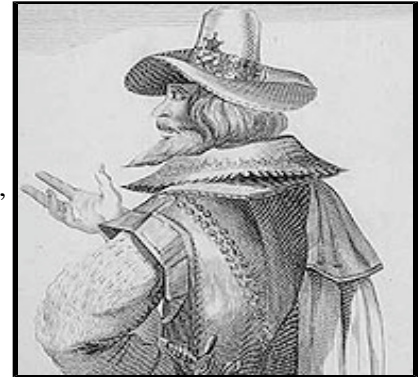
Robert Catesby, leader of the gunpowder plotters

The failed plot to assassinate James I and the ruling Protestant elite would, however unfairly, taint all English Catholics with treason for centuries to come. Who were the conspirators and what did they hope to achieve?